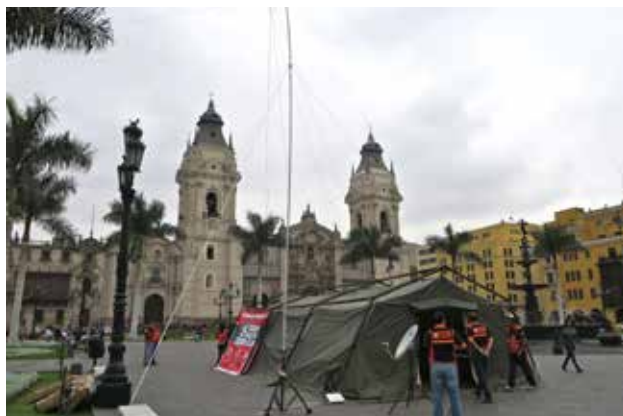
Setting up a Forward Command Post, central Lima