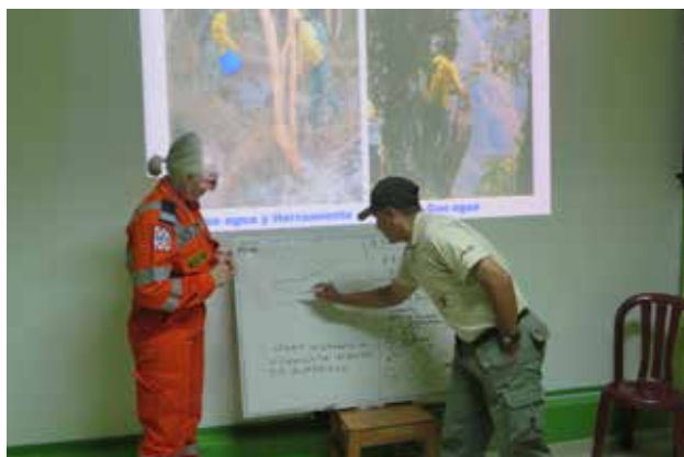
Firefighting workshop with park rangers at Piscacucho, the Macchu Picchu Historic Sanctuary

Faye Bendrups - Civil Defence in Peru: National Earthquake and Tsunami Simulation Exercises